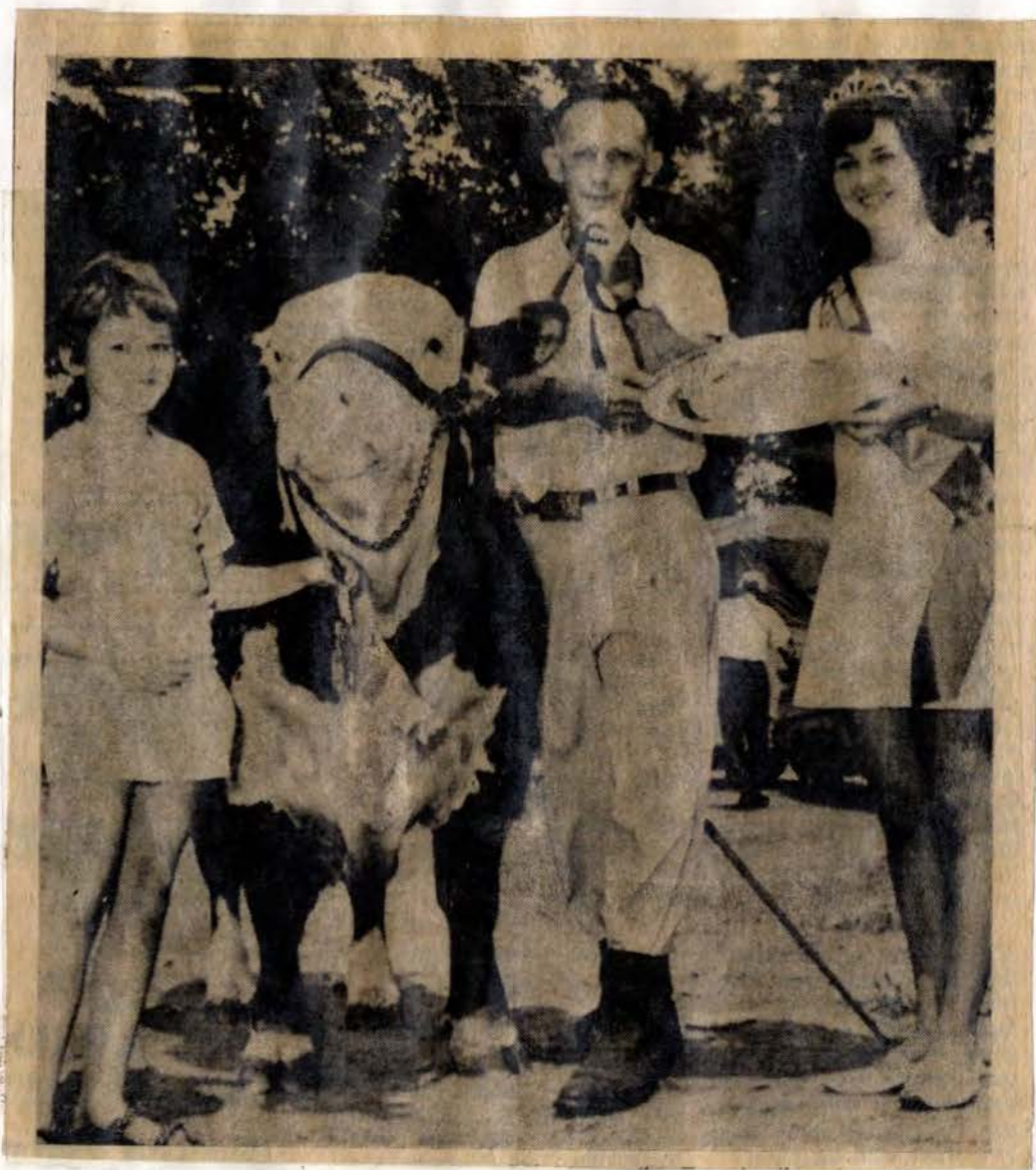
Grand Champion Herford Bull July 23, 1970